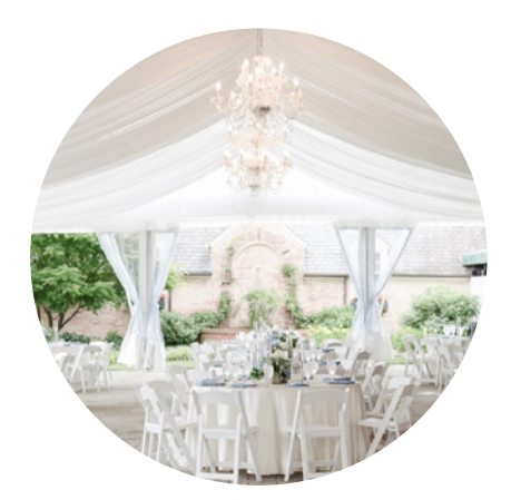
Tent liner with chandeliers

Lighting can be used around the Property and in the Grand Tent, Orangery and Carriage House.